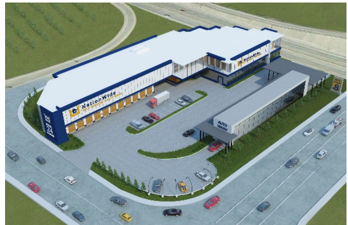
1500 Hugh Allan Drive, Kamloops, BC

As previously reported, CTA Design Group ("CTA") has been engaged by NationWide to provide both architectural and engineering services to the Kamloops property.